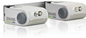
TurboFog Neo 2x2